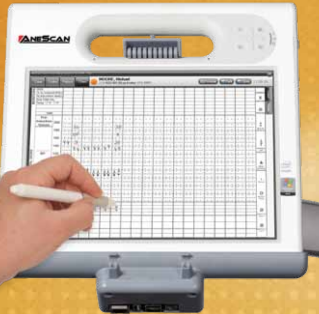
AneScan™ software works on PC's, Tablets, Laptops